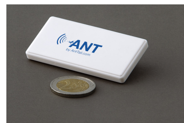
For box and package