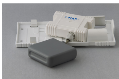
RAT for transport and pallet